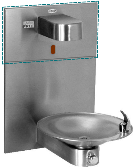
Model HFBF-RFK on 107-16 fountain with optional "Hands Free" label